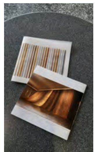
Image 3: Sample of documentation (book) and links to instagram: https://www.instagram.com/p/CtjpGr6lQ-c/

I view this residency period as a valuable opportunity for mutual learning and growth. I am dedicated to establishing meaningful connections and collaborations with other community members, artists, and curators.